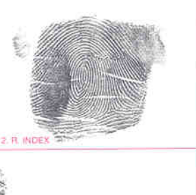
2. R. INDEX