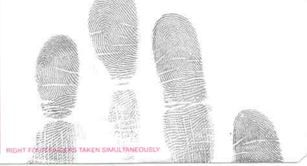
RIGHT FOUR FINGERS TAKEN SIMULTANEOUSLY