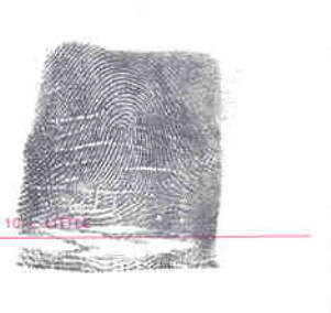
10. L. LITTLE