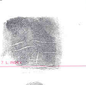
7. L. INDEX