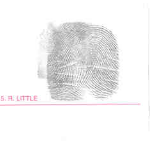
5. R. LITTLE