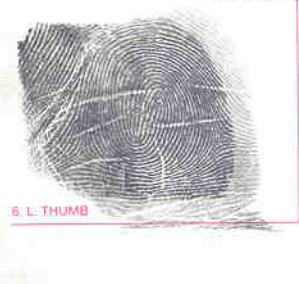
6. L. THUMB