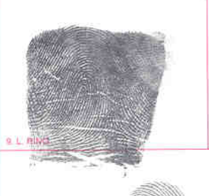
9. L. RING