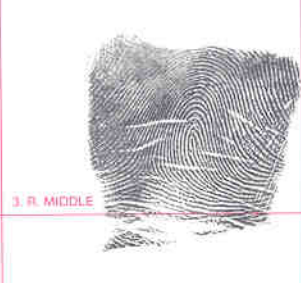
3. R. MIDDLE