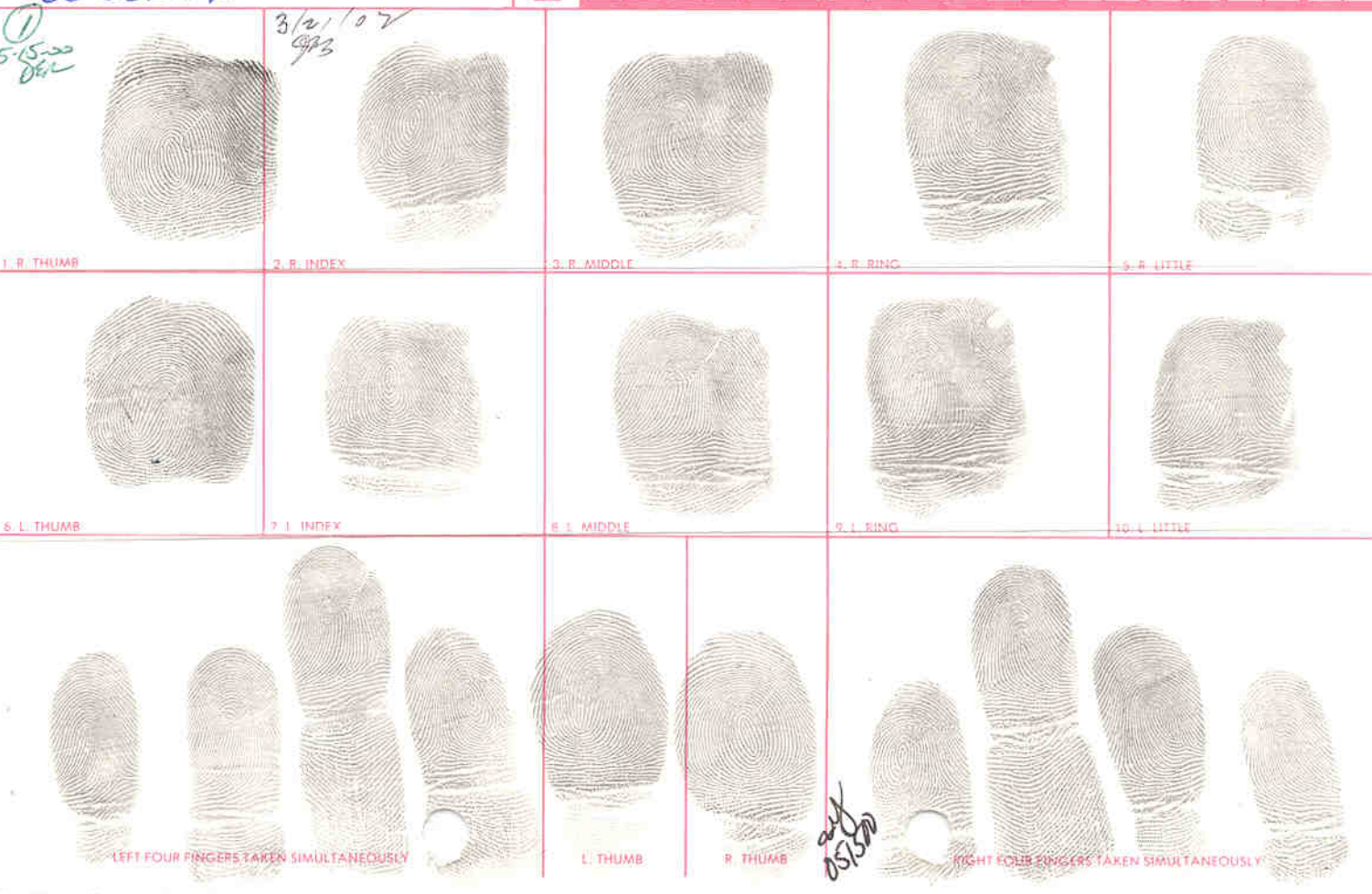
EXHIBIT _____ 1 _____ Exhibit Identification Form G 166-B (1 1-54) FPI LC 7-74 4,500 8220