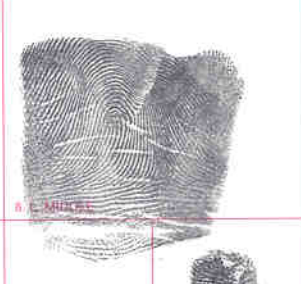
8. L. MIDDLE