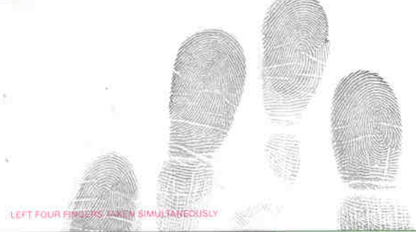
LEFT FOUR FINGERS TAKEN SIMULTANEOUSLY