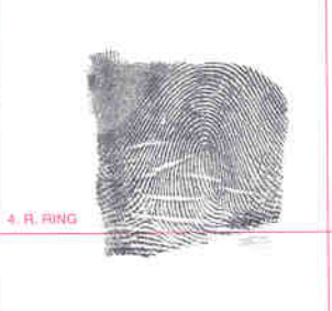
4. R. RING